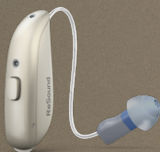
RIE 312 battery