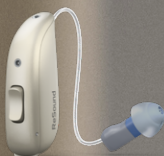
RIE 13 battery